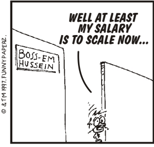
From the In-Humane Resource Dept. At FUNNY PAPERZ where we are testing a theory: The Shrinkage Factor. Toxic Effect of Ex-Wives or Seinfeld Myth?