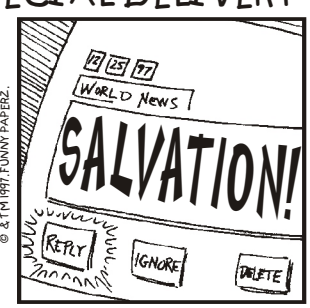
From the other wandering king at FUNNY PAPERZ where we all want for Christmas is what we used to have - All our old toys!