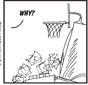
From the Archive Dept. At FUNNY PAPERZ where we are developing a vaccine based on Pack Rats. Your Generous donations are tax-deductable.