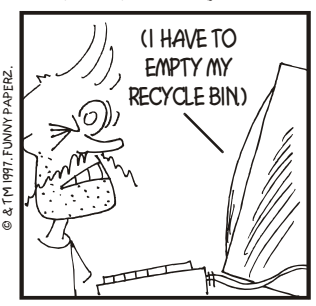
From the Lights-Out Officer at FUNY PAPERZ where we all want a drink of water & a night light before you plug, er, I mean TUCK us in.