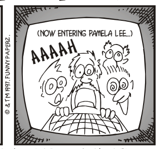
From the SurfWatch station at FUNNY PAPERZ where the price of Freedom is eternal vigilance - & Video is it's own reward...

IF YOU PAID ME BY THE "GIGGLE"-BYTE I COULD RETIRE OFF-LINE!