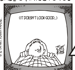
From Bachelor #1 at FUNNY PAPERZ where we're having trouble keeping our Dating Game from looking like the