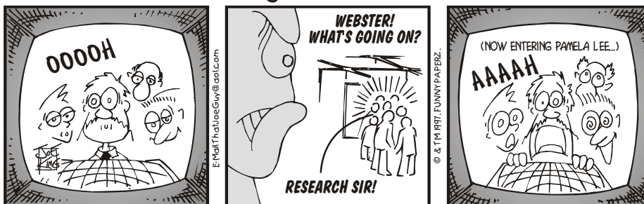
From the SurfWatch station at FUNNY PAPERZ where the price of Freedom is eternal vigilance - & Video is it's own reward...

IF YOU PAID ME BY THE "GIGGLE"-BYTE I COULD RETIRE OFF-LINE!