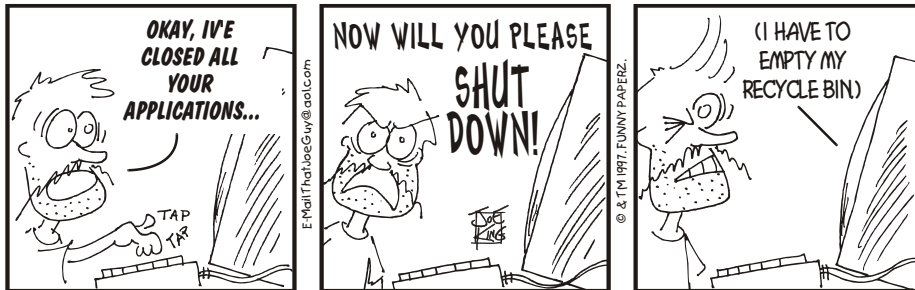
From the Lights-Out Officer at FUNY PAPERZ where we all want a drink of water & a night light before you plug, er, I mean TUCK us in.