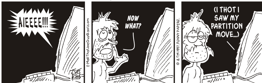
From the neurotic insomniacs at FUNNY PAPERZ - Nuff Said?