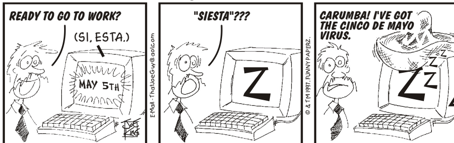
From the Bi-Lingual Education Dept. at FUNNY PAPERZ where we are stuttering, tongue-tied jabber-jaws. They say Spanish is the loving tongue...Para el corazon de mi vida!