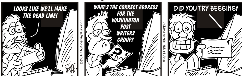
From the insufferable wannabes at FUNNY PAPERZ where our scantily clad lab assistants are using Jedi mind tricks as they lick our application envelopes...

HE'S STRANGE. HE'S WONDERFUL. ASK HIM IF HE'S JOKING- HE'LL JUST SAY