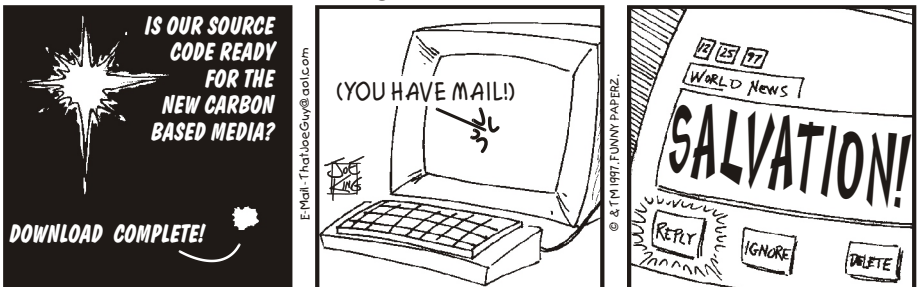
From the other wandering king at FUNNY PAPERZ where we all want for Christmas is what we used to have - All our old toys!