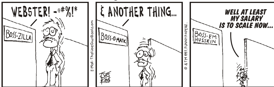
From the In-Humane Resource Dept. At FUNNY PAPERZ where we are testing a theory: The Shrinkage Factor. Toxic Effect of Ex-Wives or Seinfeld Myth?